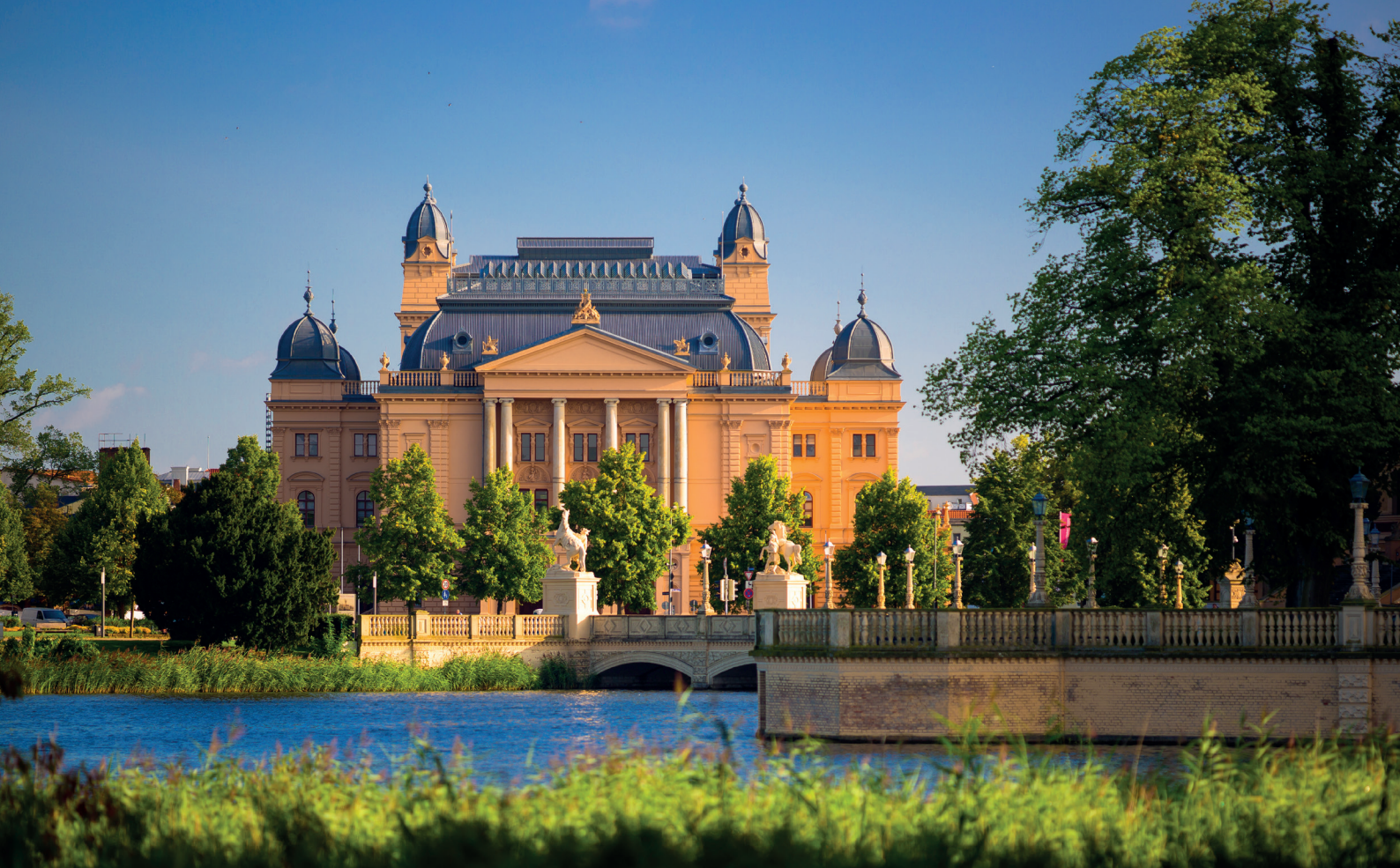
Theatre building with its water towers at Old Garden Square