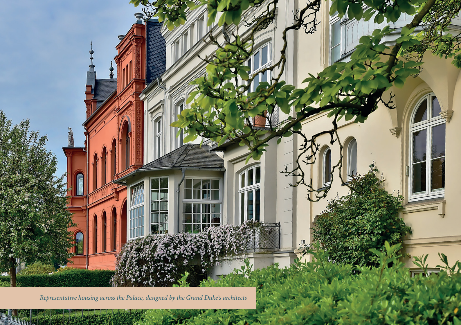
Representative housing across the Palace, designed by the Grand Duke's architects